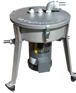
Basic Oil Centrifuge