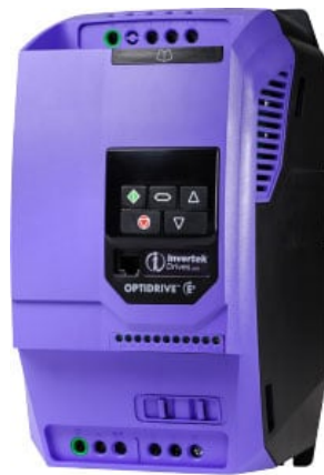
3HP VFD for 25GPM Pump Indoor