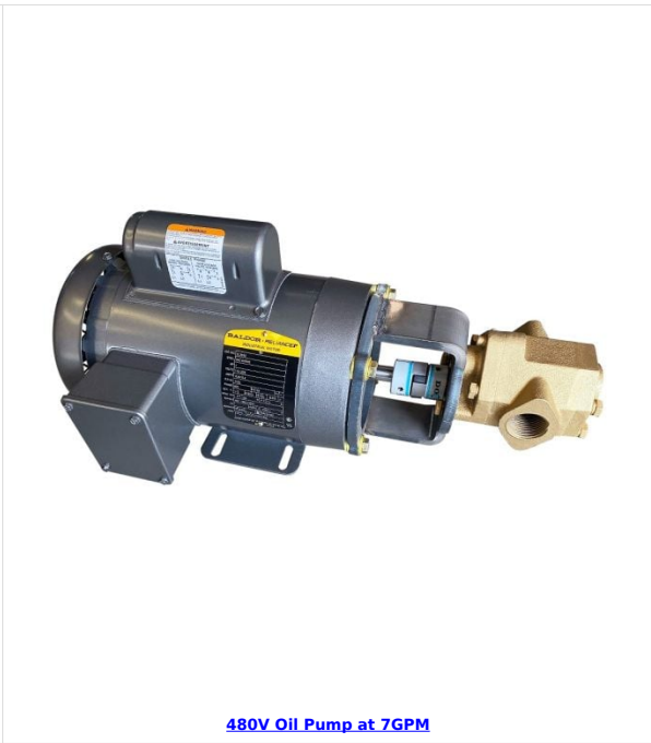
480V Oil Pump at 7GPM