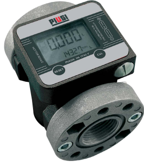
15 GPM Digital Oil Pump Flow Meter 1"