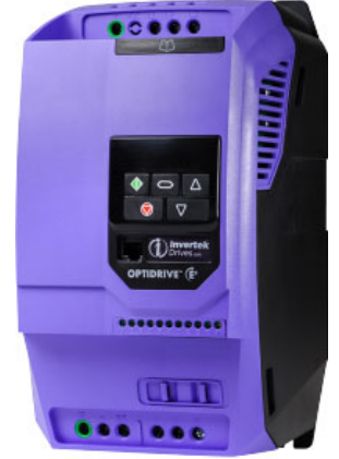
3HP VFD for 25GPM Pump Indoor

Since 2009, we have been supplying portable and stationary pumps for moving all types of oil. Oil cleaning centrifuges are also important tools to re-use oil as fuel or lubricant.