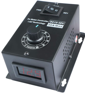
12-48v Variable Speed Controller