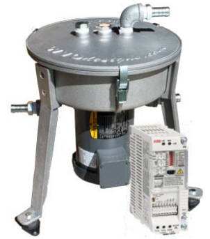
Extreme Oil Centrifuge

Since 2009, we have been supplying portable and stationary pumps for moving all types of oil. Oil cleaning centrifuges are also important tools to re-use oil as fuel or lubricant.