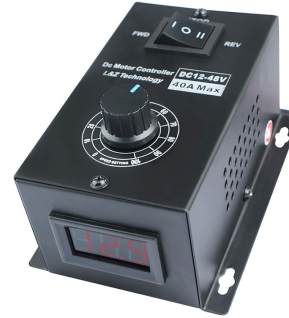
12-48v Variable Speed Controller