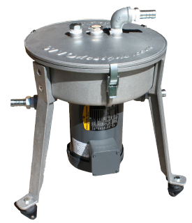
Basic Oil Centrifuge

Since 2009, we have been supplying portable and stationary pumps for moving all types of oil. Oil cleaning centrifuges are also important tools to re-use oil as fuel or lubricant.