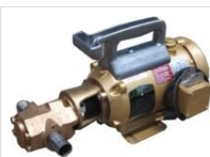
HD Portable Oil Transfer Pump - Massive Gears

Since 2009, we have been supplying portable and stationary pumps for moving all types of oil. Oil cleaning centrifuges are also important tools to re-use oil as fuel or lubricant.