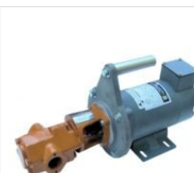
24GPM 12V Oil Transfer Pump