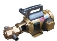
25GPM Portable Oil Transfer Pump - Massive Gears