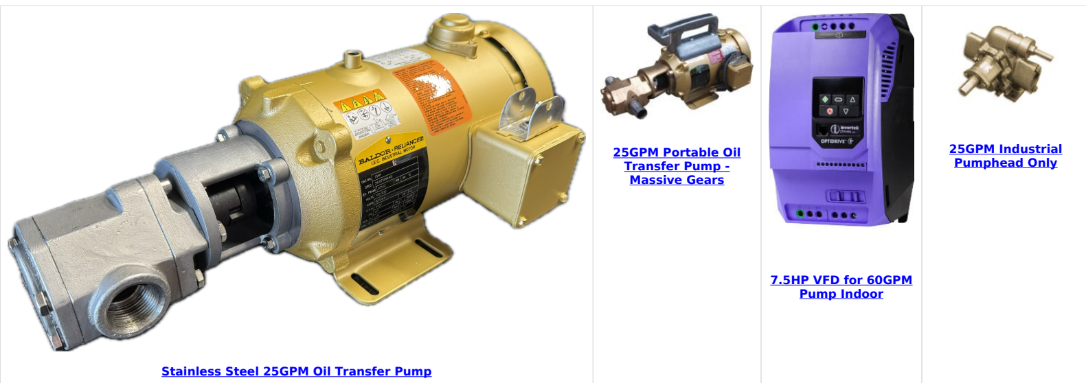
Stainless Steel 25GPM Oil Transfer Pump