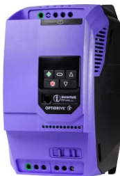
7.5HP VFD for 60GPM Pump Indoor

Since 2009, we have been supplying portable and stationary pumps for moving all types of oil. Oil cleaning centrifuges are also important tools to re-use oil as fuel or lubricant.