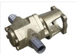
Gear Oil Pump - Pumphead Only