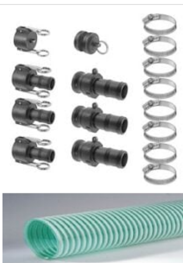
Oil Pump Hose Kit - 1.25 Inch