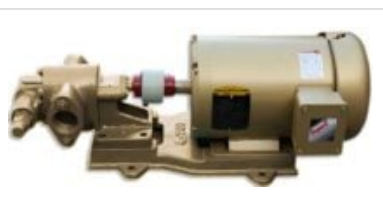
Industrial Oil Transfer Pump - 25GPM - Single Phase