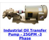
Industrial Oil Transfer Pump - 25GPM - 3 Phase