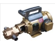
50Hz Portable Oil Transfer Pump - Massive Gears