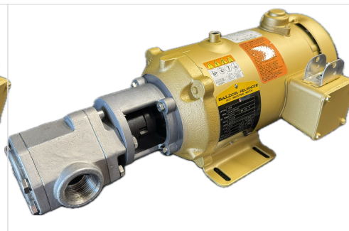
Stainless Steel 25GPM Oil Transfer Pump