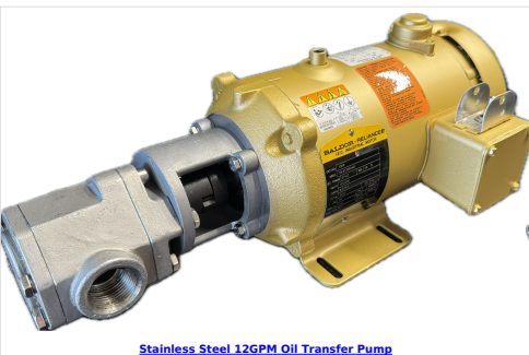
Stainless Steel 12GPM Oil Transfer Pump