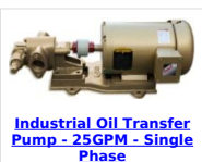
Industrial Oil Transfer Pump - 25GPM - Single Phase