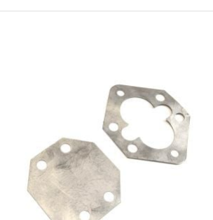
Portable Pumphead Replacement Gasket