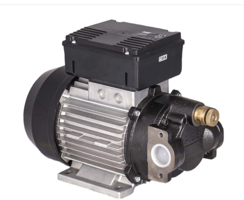
2.4 GPM Viscomat Gear Oil Transfer Pump