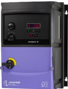
7.5HP VFD for 60GPM Pump Outdoor