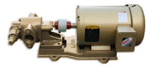
Industrial Oil Transfer Pump - 25GPM -3 Phase

Since 2009, we have been supplying portable and stationary pumps for moving all types of oil. Oil cleaning centrifuges are also important tools to re-use oil as fuel or lubricant.