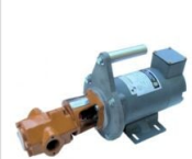
24GPM 12V Oil Transfer Pump