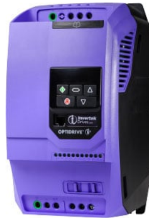
7.5HP VFD for 60GPM Pump Indoor