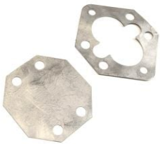
Portable Pumphead Replacement Gasket