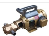
HD Portable Oil Transfer Pump - Massive Gears