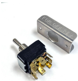
Portable Oil Transfer Pump Reversible Switch