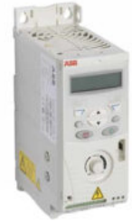
1.5HP ABB ACS 150 VFD

Since 2009, we have been supplying portable and stationary pumps for moving all types of oil. Oil cleaning centrifuges are also important tools to re-use oil as fuel or lubricant.