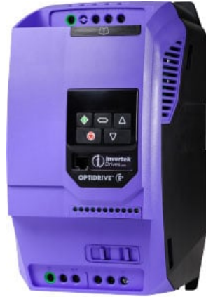
3HP VFD for 25GPM Pump Indoor