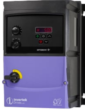
1HP VFD for 12GPM Pump - Switched Outdoor