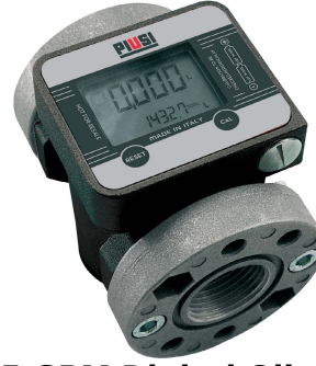
15 GPM Digital Oil Pump Flow Meter 1"