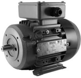
3 Phase Gear Pump Motor - Brook Crompton