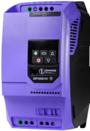
3HP VFD for 25GPM Pump Indoor