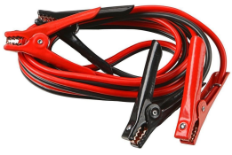
12V Cables with Alligator Clamps