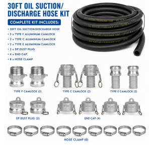
30ft Aluminum Camlock Hose Kit

Since 2009, we have been supplying portable and stationary pumps for moving all types of oil. Oil cleaning centrifuges are also important tools to re-use oil as fuel or lubricant.