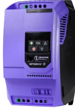
3HP VFD for 25GPM Pump Indoor