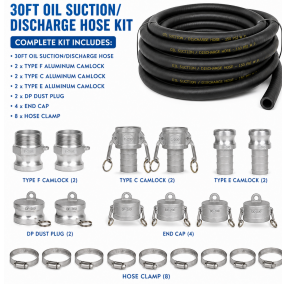
30ft Aluminum Camlock Hose Kit