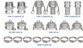
30ft Aluminum Camlock Hose Kit