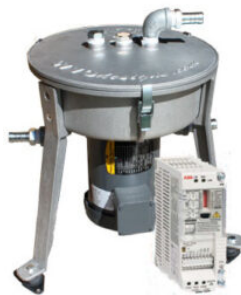
Extreme Oil Centrifuge