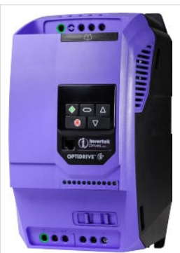
3HP VFD for 25GPM Pump Indoor