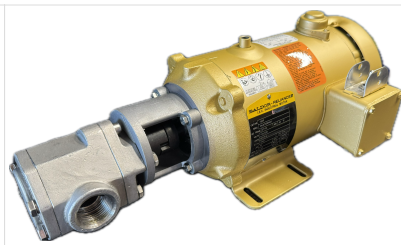
Stainless Pump with Brass Gears