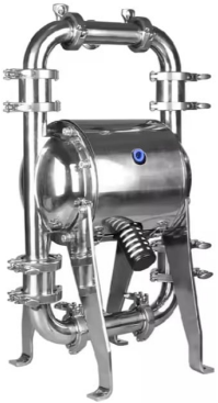
Sanitary Diaphragm Pump - Stainless 316