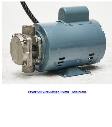
Fryer Oil Circulation Pump - Stainless