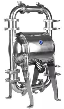
Sanitary Diaphragm Pump - Stainless

Since 2009, we have been supplying portable and stationary pumps for moving all types of oil. Oil cleaning centrifuges are also important tools to re-use oil as fuel or lubricant.