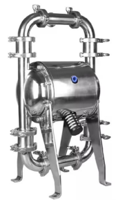
Sanitary Diaphragm Pump - Stainless 316

Since 2009, we have been supplying portable and stationary pumps for moving all types of oil. Oil cleaning centrifuges are also important tools to re-use oil as fuel or lubricant.