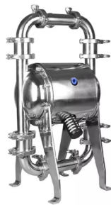
Sanitary Diaphragm Pump - Stainless