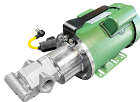
HD Oil Transfer Pump with Bypass - 8GPM