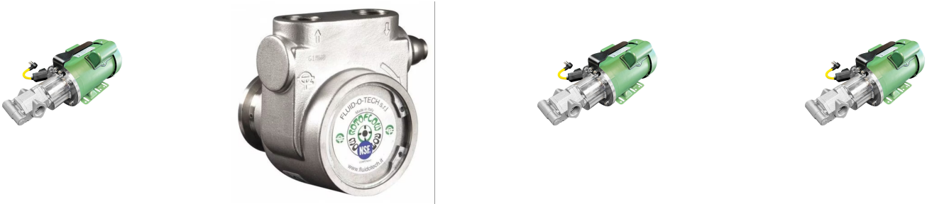
HD Oil Transfer Pump with Bypass - 8GPM