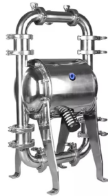
Sanitary Diaphragm Pump - Stainless 316