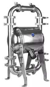
Sanitary Diaphragm Pump - Stainless 316

Since 2009, we have been supplying portable and stationary pumps for moving all types of oil. Oil cleaning centrifuges are also important tools to re-use oil as fuel or lubricant.