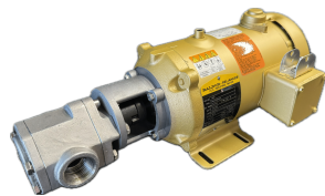
Stainless Pump with Brass Gears