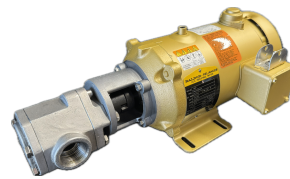
Stainless Pump with Brass Gears