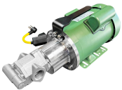
HD Mean Green Oil Pump - 20GPM