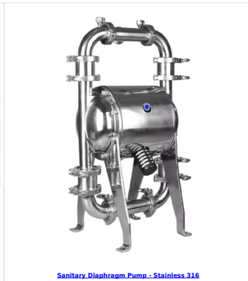
Sanitary Diaphragm Pump - Stainless 316