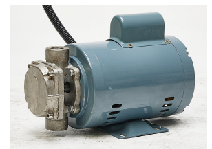
Fryer Oil Circulation Pump - Stainless

Since 2009, we have been supplying portable and stationary pumps for moving all types of oil. Oil cleaning centrifuges are also important tools to re-use oil as fuel or lubricant.