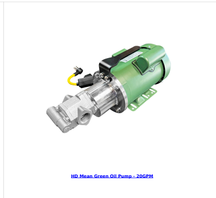
HD Mean Green Oil Pump - 20GPM