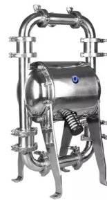
Sanitary Diaphragm Pump - Stainless 316