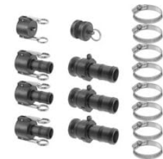
Oil Pump Hose Kit - 1.25 Inch