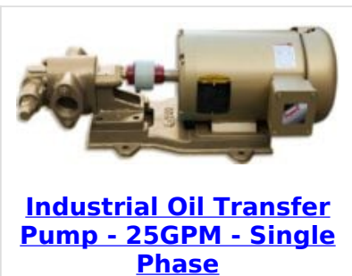
Industrial Oil Transfer Pump - 25GPM - Single Phase