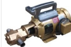
25GPM Portable Oil Transfer Pump - Massive Gears