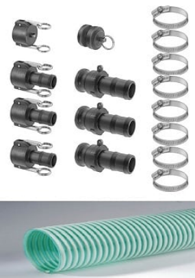
Oil Pump Hose Kit - 1.25 Inch