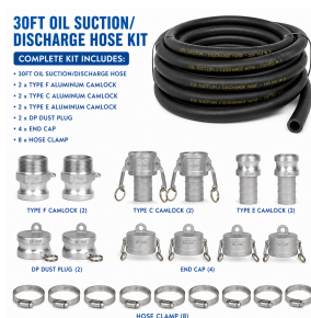
30ft Aluminum Camlock Hose Kit