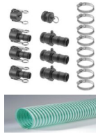
Oil Pump Hose Kit - 1.25 Inch