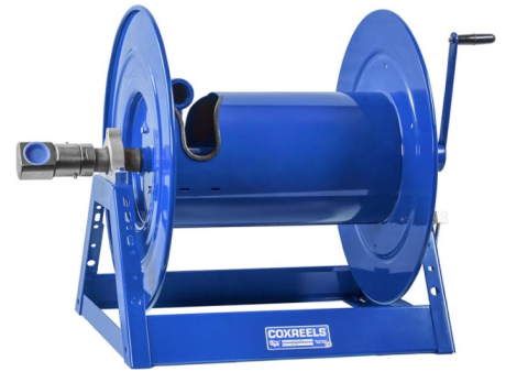
Hose Reel for Oil Transfer Hose

Since 2009, we have been supplying portable and stationary pumps for moving all types of oil. Oil cleaning centrifuges are also important tools to re-use oil as fuel or lubricant.