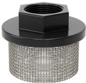
Suction Strainer for